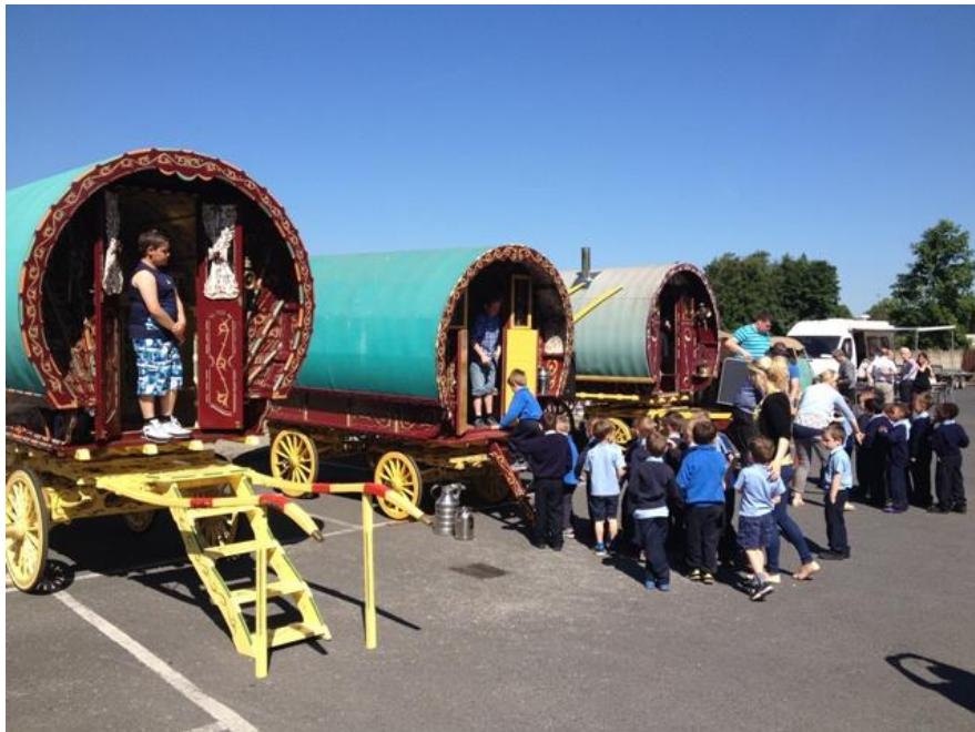
Daltaí scoile ó Scoil Náisiúnta Iósaf Naofa agus iad ar cuairt ar an taispeántas do Lá Mórtais an Lucht Siúil in Ionad Seirbhís Pobail Chaitríona

Bhí lá speisialta, 'Lá Mórtais an Lucht Siúil', ag Ionad Seirbhís Pobail Chaitríona, an 17 ú Meitheamh seo caite ina n-ionad ar Bhóthar Iósaf. Thug an Músaem roinnt nithe ar iasacht dóibh le cur ar taispeáint; nithe iad seo a fuarthas ó Ionad Oiliúna an Lucht Siúil, Ceatharlach a dúnadh go gairid roimhe sin. Thairfead an Músaem dhá fhíseán ghearra i gcomhar le hIonad Chaitríona agus Lónra an Lucht Siúil - ceann amháin de bhuíon ban den lucht siúil agus iad ag labhairt teanga an Lucht Siúil ar a dtugtar Caintis nó Gaimis; - ceann eile de bheirt fhear den lucht siúil agus iad ag cur crúite faoi chapall. Rinneadh físeán le cabhair an Mhúsaeim de Lá Mórtais an Lucht Siúil agus is féidir na trí cinn d'fhíseáin a fheiceáil ar chainéal Youtube an Mhúsaeim.