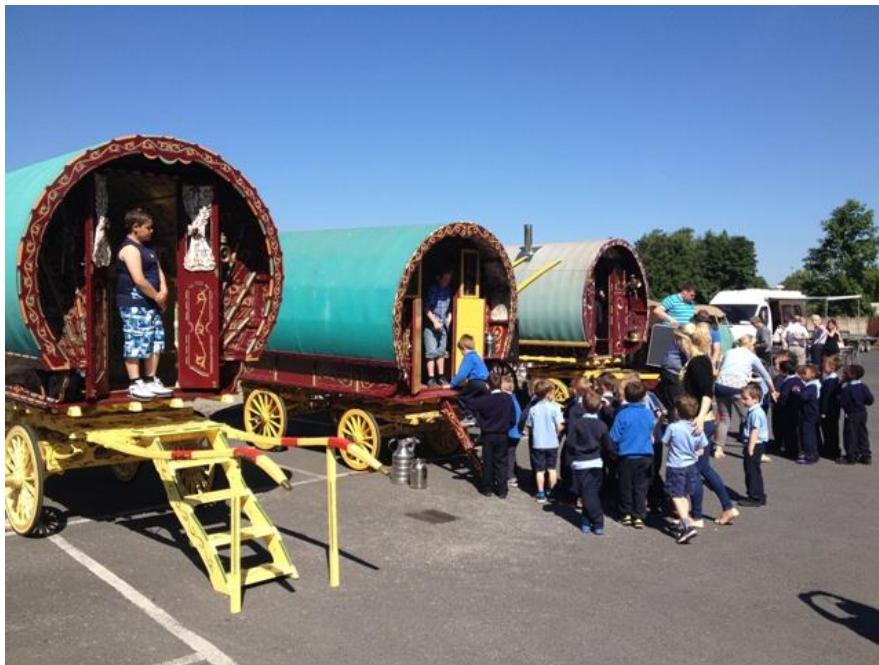
Pupils from St. Joseph's National School visiting the Traveller Pride Day display at St. Catherine's Community Services Centre

The other was with two local traveller men shoeing a horse. Through the Museum a video was made of the Traveller Pride Day and all three are available to watch on the Museum's Youtube channel.