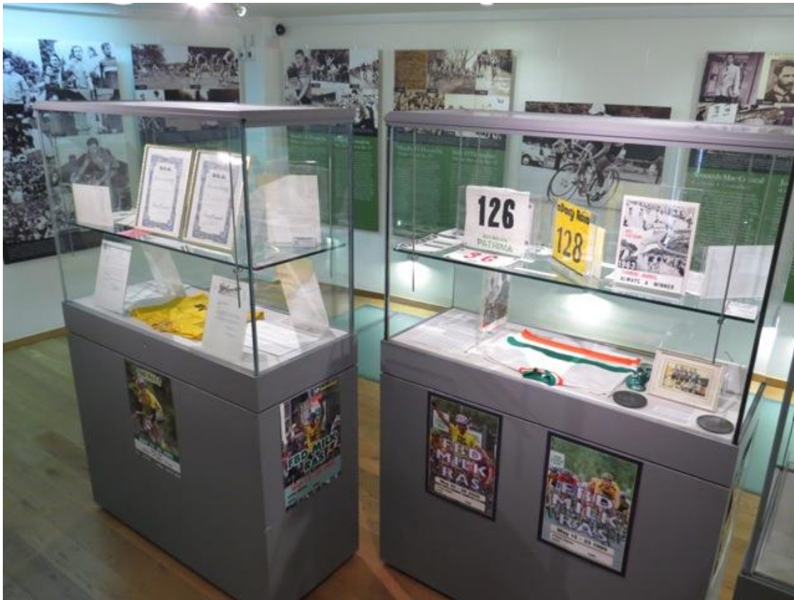
Amharc ar an taispeántas - 'Maidhc, Curadh Rás '73'.