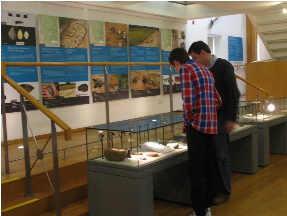
'Journeys in Time – the Archaeology of the M9 Carlow By-pass'

Significant sites include Carlow's oldest houses at Russellstown & Busherstown, the first Neolithic (4,000 - 2,500BC) houses ever discovered in the county. Many Mesolithic (7,000 – 4,000BC) objects were found including Bann flakes and stone blades. An unusual medieval ring-brooch or buckle is believed to be first of its kind found in County Carlow. Other finds range from a porcellanite stone axe originally from Co. Antrim, a number of grave goods, a red deer antler pick, pottery of different types and shapes, stone axes, stone scrapers, a medieval bone pin, different types of arrowheads and a iron quarry wedge. One Iron Age blue-green glass bead is the Museum's smallest object at less than 2mm in diameter. All artefacts on display in this exhibition are on loan from the National Museum of Ireland.