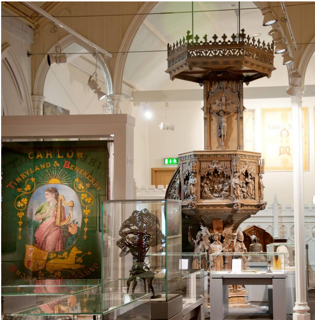
An gailearaí taispeántais ar an gcéad urlár i Músaem Contae Cheatharlach mar a bhfuil an Phuilpid ón naoú céad déag agus meirge na Léige Náisiúnta.

Tá caoga painéal sa phríomhchuid de shíleáil an tSéipéil agus óraíodh gach ceann díobh sa naoú céad déag. Ach mar bharr ar an donas cuireadh péint ar an tsíleáil am éigin sna 1960idí. Athóraíodh an caoga painéal go stuama tar éis don phríomhchuid de na hoibreacha tógála a bheith críochnaithe agus sular cuireadh isteach na taispeántais.