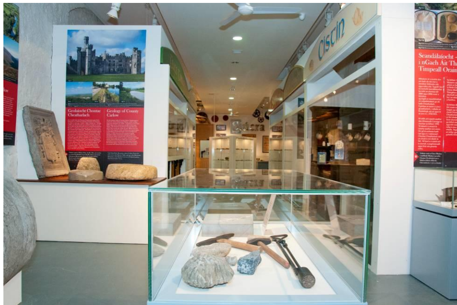
An gailearaí taispeántais ar an mbunurlár i Músaem Contae Cheatharlach.