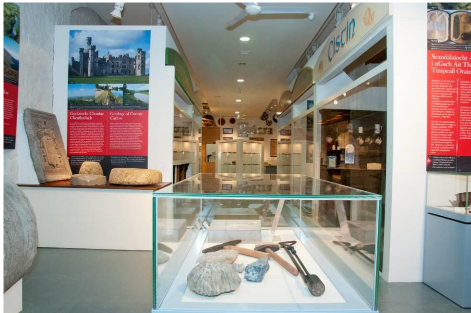
Carlow County Museum ground floor exhibition gallery.