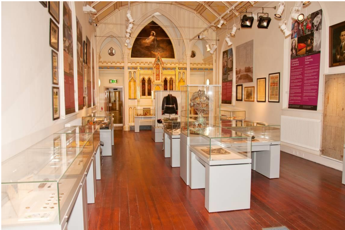
Na gailearaithe taispeántais ar an gcéad urlár i Músaem Contae Cheatharlach.

chomhpháirtíocht phríobháideach phoiblí í i stair an Stáit agus ba ghnó talmhaíochta í ar bhain an nuálaíocht léi freisin. An gailearaí taispeántais sa Séipéal a bhí sa Chlochar tráth - is ann atá an ní is mó atá sa Mhúsaem, an phuilpid a snoíodh go stuama ealaíonta le lámh sa 19ú céad agus a bhíodh in Ard-Eaglais na Deastógála. Meastar go bhfuil sí ar cheann de na puilpidí is breátha dá bhfuil sa tír. Áirítear iad seo leis na nithe atá i mbailiúchán an Mhúsaeim - eiseamail seandálaíochta annamha de thuanna agus de chlainmte, soitheach bia ón gCré-umhaois agus píosa airgid Éireannaigh fíorálainn ón aonú céad déag agus ar cuid é de bhailiúchán Jackson. Léiriú ar cheirdeanna agus ar an saol tráchtála atá sa taispeántas atá ar an mbunurlár - ceárta, siopa, teach ósta, an Mhonarcha Bróg, trealamh don phluiméir, don siúinéir, don bhearbóir agus cistin. Feictear an chomhla a bhíodh faoin gcroch i bPríosún Cheatharlach sa chuid a bhaineann le riail agus reacht. Seans gurb í seo an t-aon cheann amháin atá ar taispeántas i Músaem in Éirinn. Beifear ag cur le gach ceann de na taispeántais agus á bhfeabhsú in imeacht na mblianta.