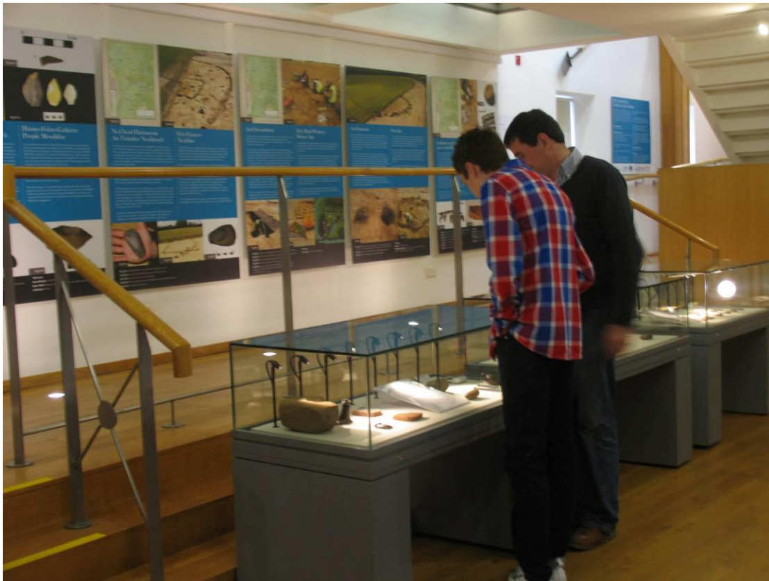
Turais siar sna blianta - Seandálaíocht Sheachbhóthar Cheatharlach ar an M9'

Áirítear na tithé ba shine i gCeatharlach i mBaile an Ruiséalaigh agus i mBaile Bhúiséir ar na láithreáin shuntasacha - is iad seo na chéad tithé Neoiliteacha (4,000 - 2,500BC) a dtángthas orthu sa chontae. Thángthas ar go leor nithe Méisiliteacha (7,000 – 4,000BC) lena n-áirítear Calóga na Banna agus lann chloiche. Creidtear gurb í an dealg fháinneach mheánaoiseach neamhchoitianta nó búcla an chéad cheann dá leithéid a fuarthas i gContae Cheatharlach. Áirítear iad seo a leanas i measc na bhfionnachtana eile a dtángthas orthu - tua cloiche poircealláiníte a tháinig as Co. Aontroma, líon áirithe d'earraí reilige, piocóid déanta as beann fia rua, cineálacha agus cruthanna éagsúla d'earraí criadóireachta, tuanna cloiche, scríobairí cloiche, biorán cnáimhe meánaoiseach, cineálacha éagsúla de reanna saighde agus ding iarainn le haghaidh an chairéil. Is é an coirnín gloine gormghlas ón Iarannaois an ní is lú atá sa Mhúsaem. Tá a thrastomhas faoi bhun 2mm. Fuarthas na déantáin go léir atá le feiceáil sa taispeántas seo ar iasacht ó Ard-Mhúsaem na hÉireann.