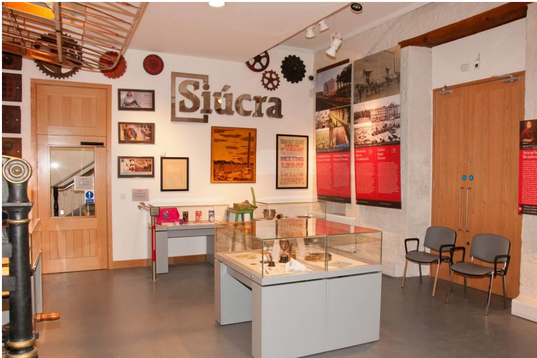
An taispeántas atá i Músaem Contae Cheatharlach faoin Monarcha Siúcra

Go dtí 1960, bhíodh bunscoil an Chlochair ar an áit a bhfuil bunurlár an Mhúsaeim anois. Trí sheomra ranga a bhíodh ann agus spiaráí eatarthu agus is ar an bpasáiste ar thaobh Shráid an Choláiste den fhoirgneamh a bhíodh na doirse. Is iomaí úsáid a baineadh as na seomraí seo ó 1989 i leith le haghaidh imeachtaí a bhí ag an bpobal agus ag eagraíochtaí deonacha agus mar sin rinneadh athruithe ar roinnt áirithe de na seomraí. Cinneadh aon spás fairsing taispeántais amháin a dhéanamh den bhunurlár ionas go bhféadfaí na gailearaithe taispeántais a bhogadh ó áit go háit sa Mhúsaeim.