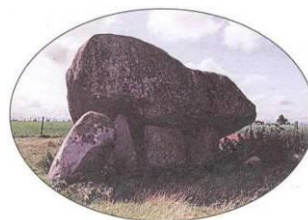
Carlow Historical & Archaeological Society