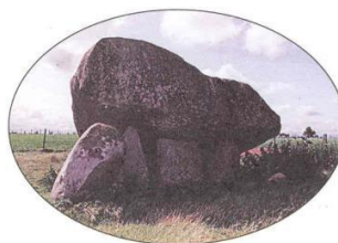
Carlow Historical & Archaeological Society